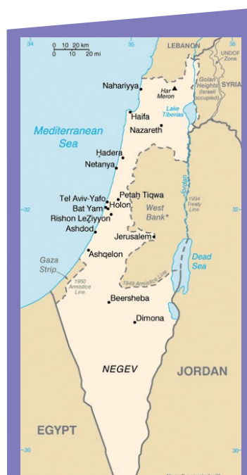
IMG WIKIPEDIA , Israel's borders in 1948.

There is no peace on Israel's northern border either, and there too, a large military force is protecting the residents of the north and the rest of Israel's population from our enemies in Lebanon.