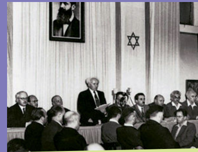
Ben-Gurion declared the independence of the State of Israel on May 14 th 1948

In the Declaration of Independence, Israel did not declare what its borders were. They were fixed gradually, over the years.