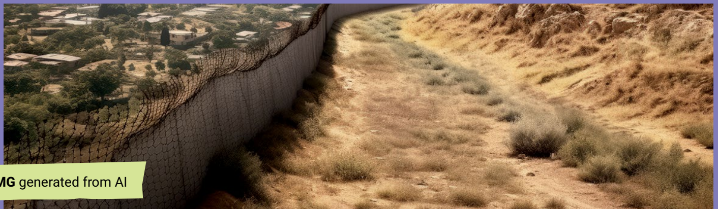
IMG generated from AI

And political borders, with the countries next to it – Jordan, Lebanon, Syria and Egypt.