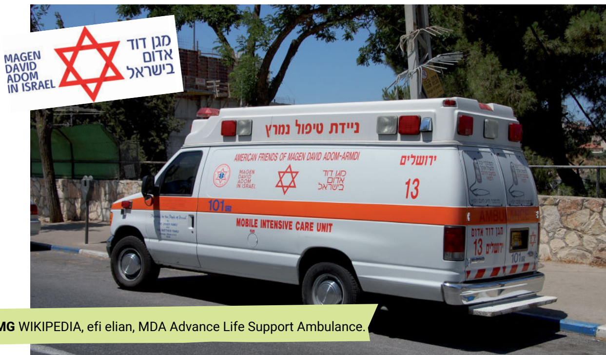
IMG WIKIPEDIA, efi elian, MDA Advance Life Support Ambulance.

In places like these, volunteers go through special training and actually become official first aid providers.