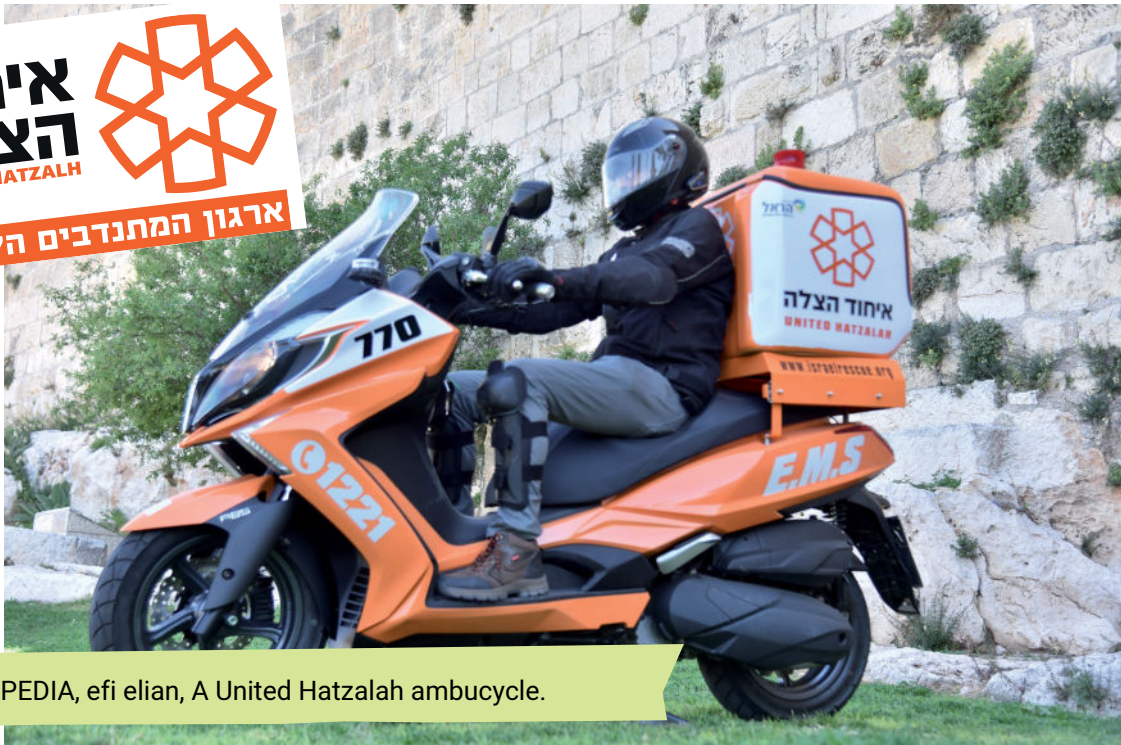
A United Hatzalah ambucycle.

You can spot Ichud Hatzala volunteers by their special motorcycle, the ambucycle. This is a motorcycle fitted with advanced medical equipment, so the driver can get anywhere quickly, and save lives.