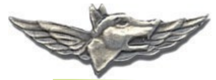
The Oketz emblem