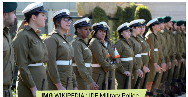
IDF Military Police