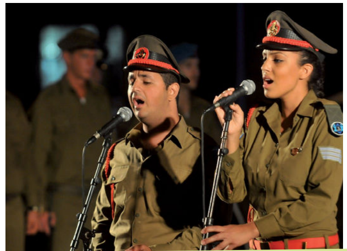
IMG FLICKR // Israel Defense Forces IDF Band Sings 2011

Today, there are even young men and women with special needs or disabilities who can contribute their talents and be part of the People's Army. Their service is voluntary.