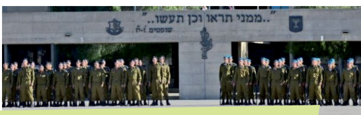
IMG «See my example and do the same...» centrally located in the IDF Officers' School Training Base.

The IDF chose to immortalize Gideon's lesson of personal example, and put it on the wall of the Officers' School, where all soldiers destined to become IDF officers study and train. And indeed, the IDF commanders of today learn about these key values of personal example, and leadership, from the commanding officer and judge who led the Jewish people thousands of years ago.