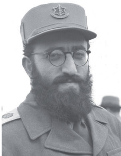
IMG WIKIPEDIA : Rabbi Shlomo Goren, the first Chief Military Rabbi for the Israel Defense Force

The IDF is a significant part of Israeli identity, and carries great value in creating connections within the people and bridging gaps between the different Israeli sectors and cultures.